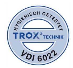
Conforme à VDI 6022